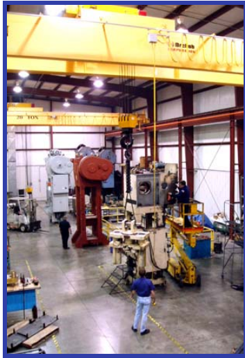
Modern 50,000 Sq. Ft. Facility

Comprehensive Press Rebuild, Repair and Maintenance