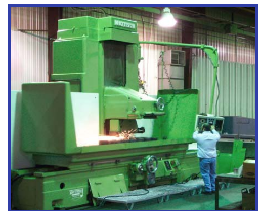
Surface Grinding to 36" x 96" x 40"

and a wide array of additional manufacturing services