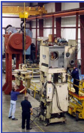
40 Ton Lifting Capacity for Large Assemblies

4 Axis Milling Capacity to 1000 Cubic Feet (120"x 120"x 120")