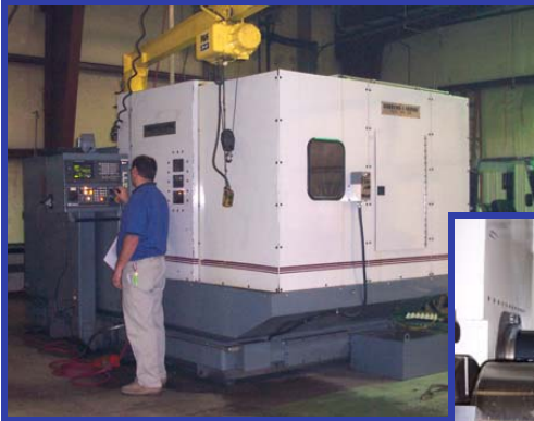
CNC Turning to 35" Diameter