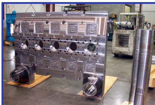
Large Components and Tight Tolerances